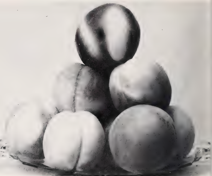
A Plate of Luscious Herb Hale Peaches